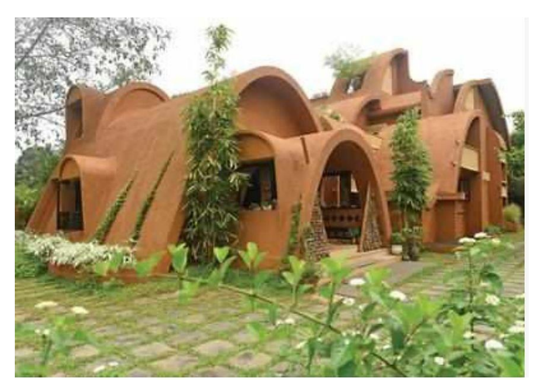
Image -3, Mud House, Kerala

Another beautiful example of art and sustainable architecture is Mud Houses. Mud construction system is less energy intensive and very effective in different climate conditions . Earth Is one of man's oldest building materials and most and share civilizations used in some form. It was easily available cheap and strong and required only simple Technology . In Egypt The Grain stores of Ramassume building built in Adobe in 1300 BC still exist ,the Great Wall of China has sections built in rammed earth over 2000 years ago . Iran ,India ,Nepal, Yemen all have examples of ancient cities and large buildings built in various forms of earthen Constructions.<sup>5</sup> History repeats itself nowadays. There is a craze for mud houses in hotels, restaurants , guesthouses , and for personal homes also . Kerala based Architect G Shankar mud house at Mudavanmugal in Thiruvananthapuram, is the eye catching 3000 square feet mud house near banks of Vellayani lake.<sup>6</sup> [image - 3]