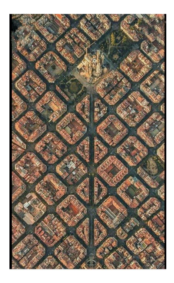
Image - 4, Barcelona City - Spain Land Art

And second, his plan embodied what is - then and today- a striking egalitarianism . Each block [manzana] was to be of almost identical proportions, with buildings of regular height and spacing and preponderance of green space. Commerce was to take place on the ground floor , the bourgeoisie were to live on the floor above[ rather than and mansions at the edge of town and the workers were slated for the upper floors . In this way they would all share the same streets and public spaces, exposed to the same hygienic conditions , reducing social distance and inequality . [ image - 4]