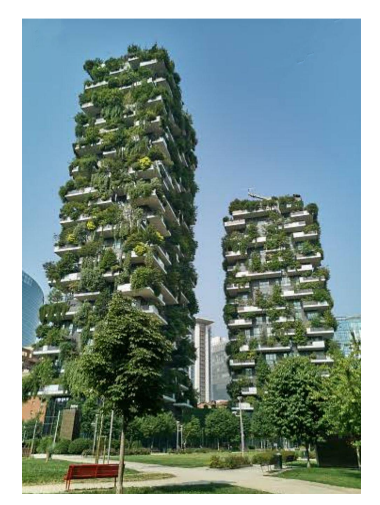
Image -2 , Bosco -Verticale -Milan [Italy] , [image source - wikipedia -e net ] Copyright © 2022, Scholarly Research Journal for Interdisciplinary Studies

The buildings biodiversity is expected to attract New birds and insecst species to the city. It is also used to moderate temperatures in the buildings in the winter and summer by shading the interiors from the sun and blocking Harsh winds. The vegetation also protects the interior spaces from noise pollution and dust from street level traffic. The building itself is self-sufficient by using renewable energy from solar panels and filtered Waste water to sustain the building's plant life; these green technology systems reduce the overall waste and carbon footprint of the towers . [image -2 ]